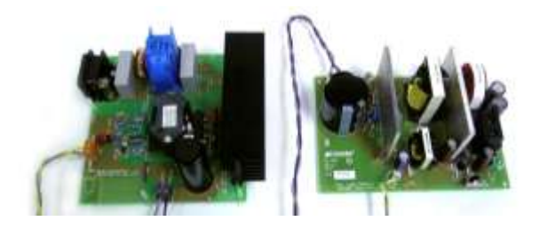
ON Semiconductor PFC (left) and Power Integrations switch mode PS (right)

The 300 W SMPS Ecos tested (See our 'Ac-Dc Power Supplies' report) has the ability to shut down its main supply and only operate the standby supply where required. The Power Integrations (PI) TFS762HG provides independent switching for the main and standby supplies and when put in standby, disengages the main supply. The standby mode also shuts down the ON Semiconductor NCP1654 Power Factor Correction (PFC) controller, allowing the front end to go to a lower power simple rectification mode. This combination of small standby load, an efficient standby PS, and a lower standby current on the main supply, results in a highly efficient supply with standby no-load dissipation within the SMPS of 0.10 W. This 300 W supply uses less than half of the no-load power of a small cell phone PS,<sup>2</sup> cutting the standby losses in the power supply to a minimum. It should be noted, however, that a PS is only as efficient as the product it powers. End use devices must still be carefully designed to generate very small standby loads on the power supply.