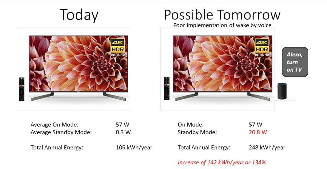
FIGURE 2: POTENTIAL IMPACT OF POOR WAKE BY VOICE IMPLEMENTATION IN TVS<sup>19</sup>

Another innovation we might see are Internet-connected televisions that come with full smart speaker-type capabilities built into them, eliminating the need to purchase and install a smart speaker near the television to achieve hands-free operation. We believe that these implementations can achieve low-power standby as well. Amazon provides many low-power reference designs that manufacturers can leverage to develop Alexa-enabled products with low standby power. Other voice assistant developers may provide low-power reference designs as well. The ball is in the court of the TV manufacturers.