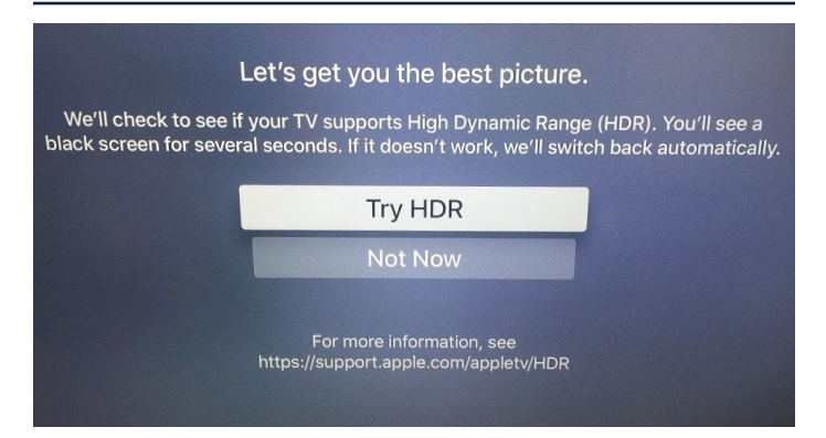
FIGURE 3: APPLE TV PROMPT WHEN CONNECTED TO A NEW TELEVISION

Four of the eight televisions tested at typical room lighting levels have an energy-saving feature called Automatic Brightness Control (ABC) that is enabled by default for SDR content and automatically disabled for HDR content. These televisions experienced an average on mode power increase of 100 percent when we accepted Apple's offer to get the best picture and tried HDR. Table 10 reflects the results.