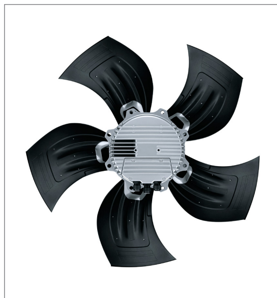
FIGURE 2: Fan-MDU: motor and fan

The metrics and methodologies used to define efficiency within MEPS also differ between countries. China uses input/output metrics in all types of MDU. In the EU and USA, the efficiency metric used for clean water pumps is aligned (hydraulic pump efficiency), but there are differences in the calculation methodology. For circulators the EU uses a relative efficiency index.