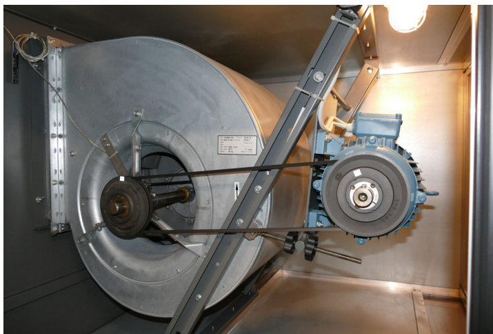
FIGURE 3: Three pump-MDUs. Composition of one unit (from left to right): pump, mechanical equipment (clutch), motor

As countries/regions (EU, US) seek to establish minimum efficiency requirements for complete MDUs, they also consider appropriate testing, calculation methods and performance requirements. International standards for complete MDUs are not as advanced as for MDU-components and the need for further work in this area is evident, as illustrated by the development of ISO 12759 standard for fans, which originated from the EU regulations for circulators and fans.