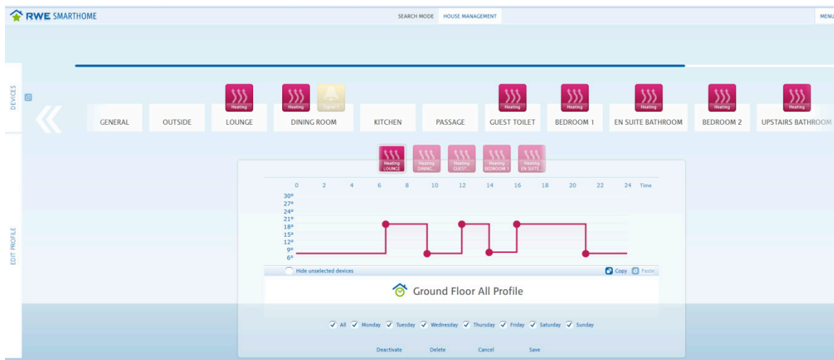
Figure 1. Screenshot of House 3 'Ground Floor All' profile (taken on 09/12/14, 4 mths after installation).