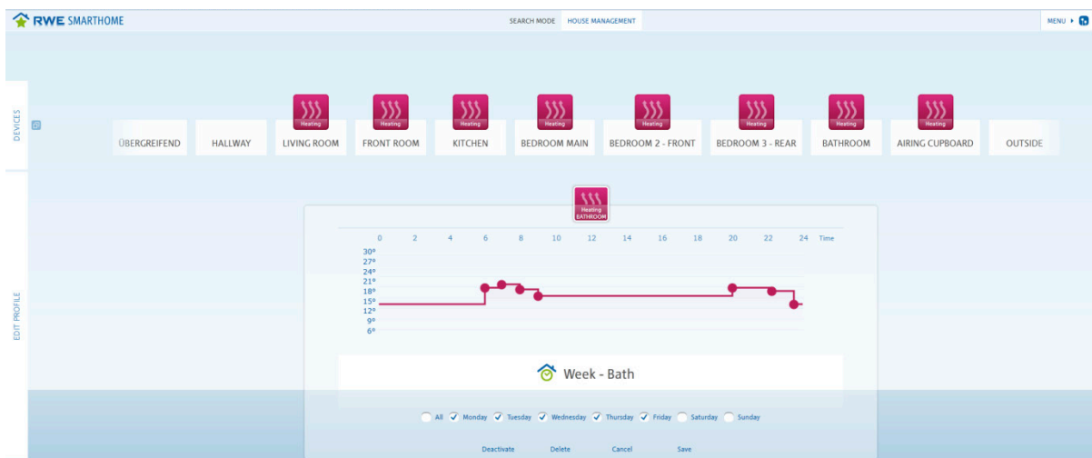
Figure 3. Screenshot of House 19's weekday 'Bath' profile (taken on 9/12/14, 2.5 mths after installation).

With the Z-Wave system, by contrast, screenshots indicate that no automated time profiles have been set up at all. Keith suggests they have not really used the Z-Wave system: